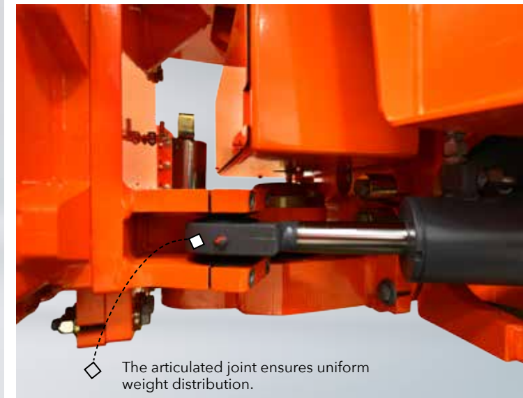
The articulated joint ensures uniform weight distribution.

The HAMM 3-point articulation is the key to an exceptionally favourable weight distribution, enormous driving stability and supreme traction.