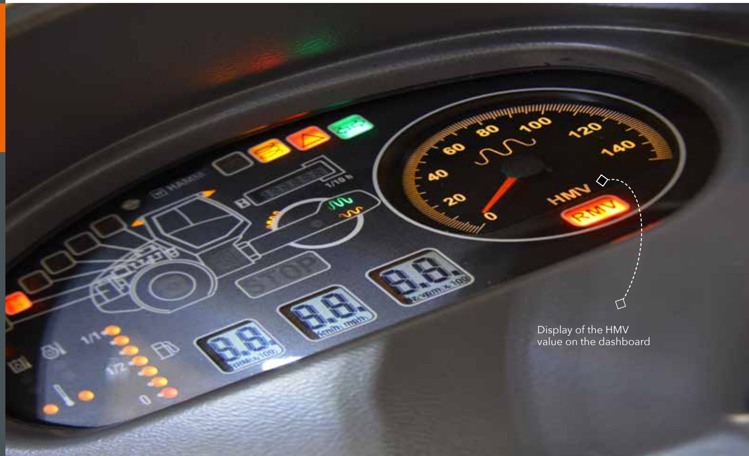
Display of the HMV value on the dashboard